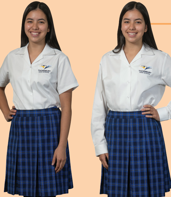
Uniform Option 4