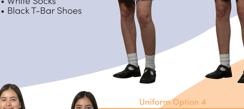
Uniform Option 4